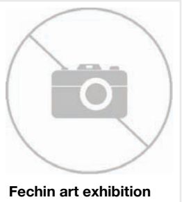
scheduled for Taos